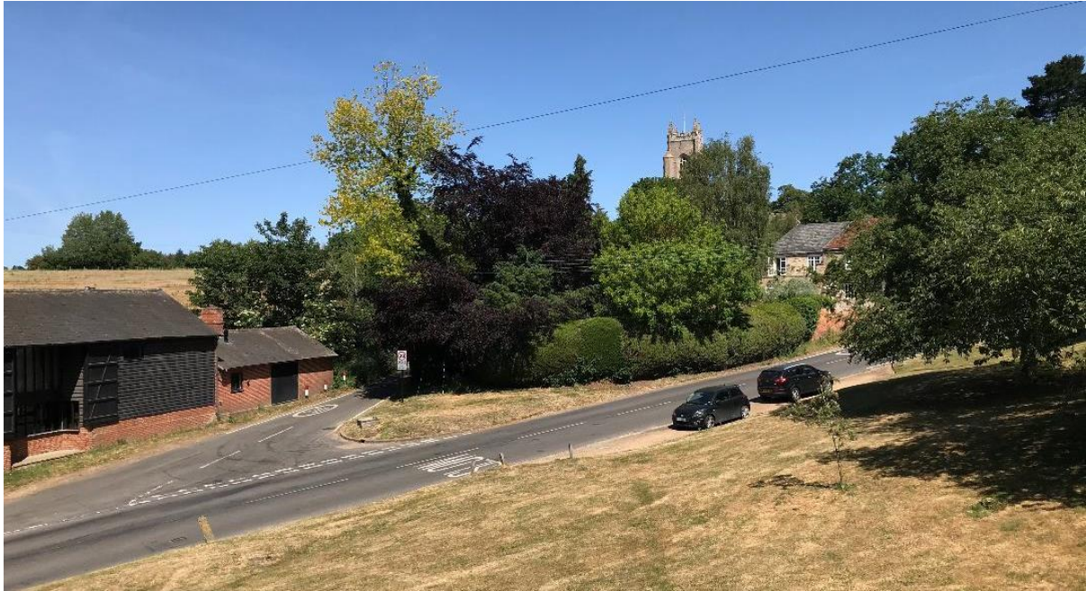
The view from Downs almshouses

They continue to provide low-cost accommodation for four single people, in an area where such accommodation is about as rare as hens' teeth.