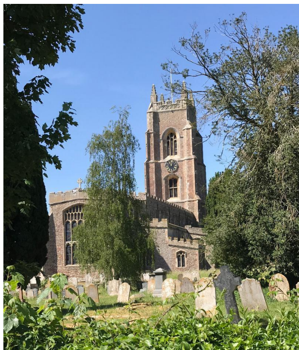
The view from 3 Rowley Cottages