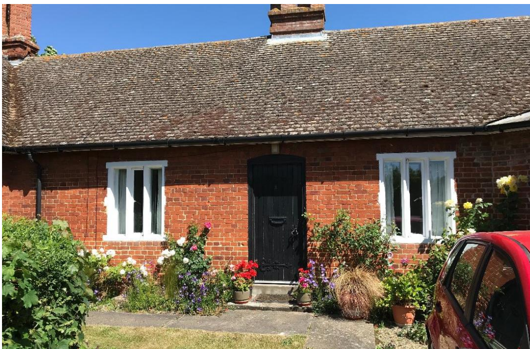
No.3 Rowley Cottages

It has ambitions to increase the housing it can provide. In 2016 LAWC acquired No.3 Rowley Cottages, by the churchyard in Stoke, from Babergh District Council. Development projects are described below.